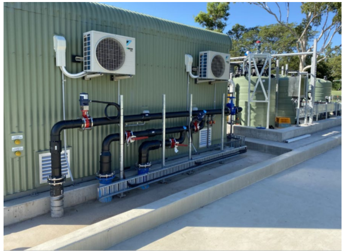
Koumala resin exchange drinking water plant under construction