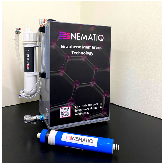
NematiQ Graphene Membrane Laboratory Demonstrator

Flat sheet Graphene Membranes have now been converted into 4040 and 8040 cartridges which will be used in larger scale demonstrations at municipal and industrial sites.