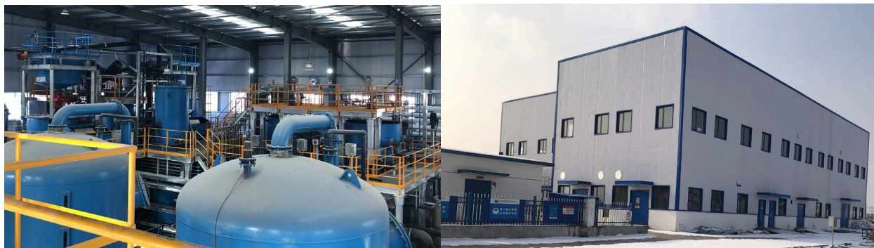
BIONEX™ plant at Ordos

The BIONEX™ plant will be the first of its kind in China and will act as a demonstration site for other prospective customers. The market for BIONEX™ includes nitrate removal from effluents from mines, industrial processes, and municipal water treatment facilities located in ecologically sensitive areas such as the Yellow River basin in Northern China where this first project is located. Several prospective customers have indicated strong interest in visiting the plant upon the start of full operations when various COVID related travel restrictions are lifted.