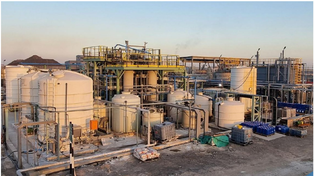
Oman CIF® plant

We will provide ongoing service support with our partner Multotec including spare parts, consumables and inspection services.