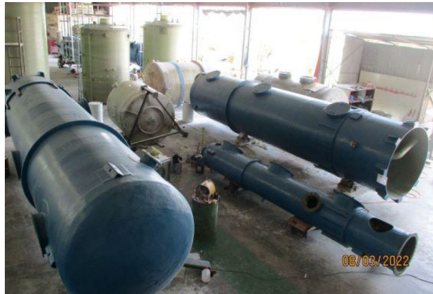
EVAPX® plant render and manufactured columns